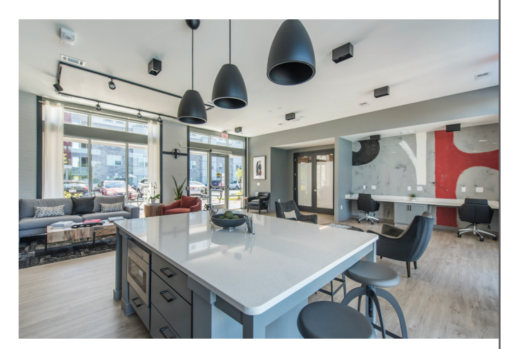
Amenities include a community clubhouse.

Rising from behind I-95, The Foundry provides 200 affordable units in a region with an accelerating housing affordability crisis. All of the units are income-based, including one-, two- and three-bedroom apartments with 10 floor plans to choose from. The property is near Virginia Union University and other employment centers, and has a swimming pool, community clubhouse and playground for residents to enjoy.